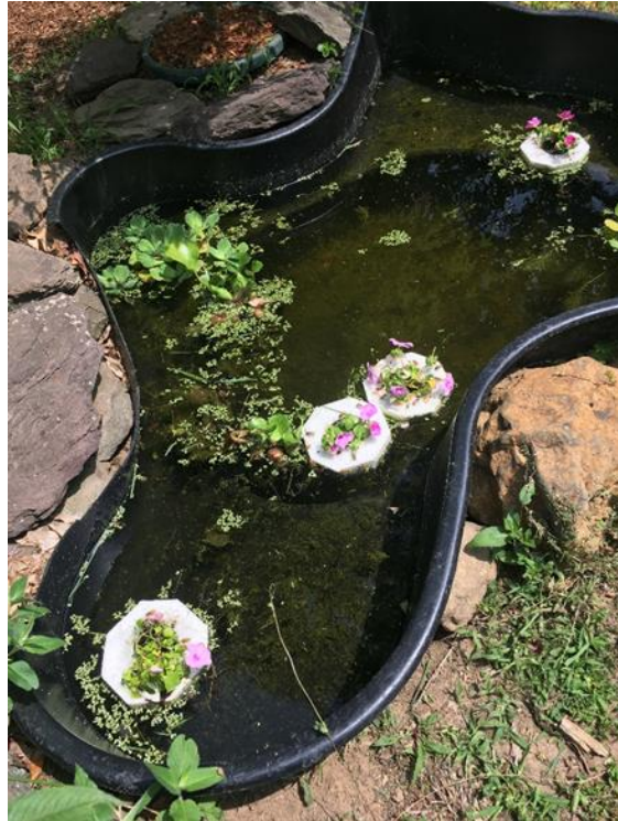
A nice small pond near the bee hives.